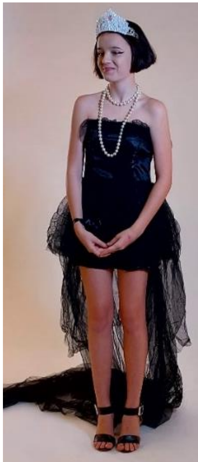
Mistress of Evil. By Luci Downes

group got creative and created a wearable art garment that reflected one of four design briefs. Friday 27 May saw three complete entries venture over to The Regent on Broadway to present their garments in a photoshoot and short catwalk.