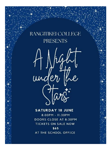
Senior School Ball - Tickets are available now at the office!