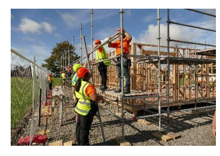
The Building Academy worked through the school holidays, making great progress in the good weather.